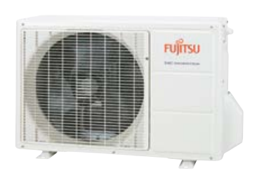
ASTG07 / 09 / 12