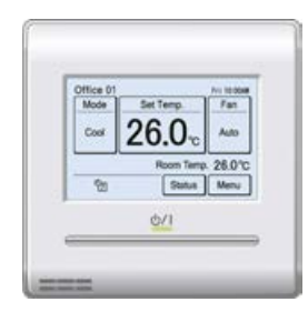
Wired Touch Controller* *30 / 34 only.